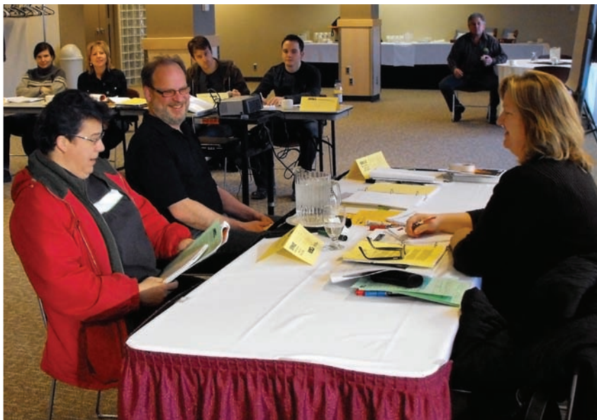
Stewards worked through a mock grievance hearing at AUPE offices in Calgary on March 20, 2009.