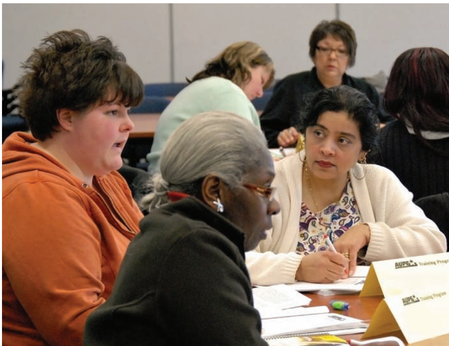
AUPE members work through an exercise at a Respect in the Workplace course on March 20, 2009 at union headquarters